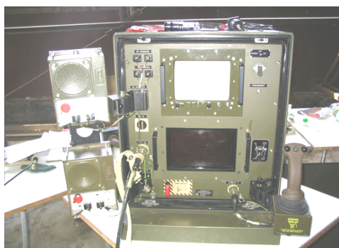
Fig. 1 Fire control system

From the action point of view it is intended to control air targets closely spaced, low and very low height and light armored ground targets.